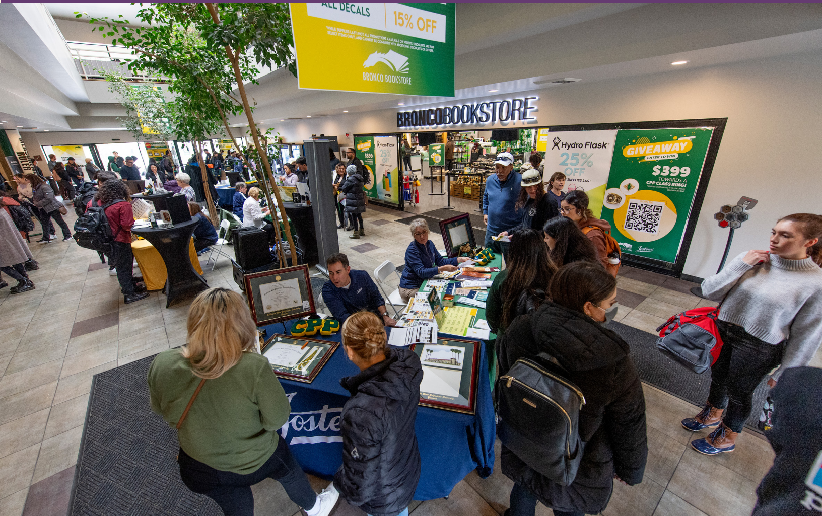
Bronco Bookstore hosts Grad Fair! Read more on page 11